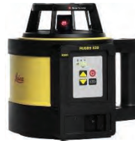
• Leica Rugby 820 Rotating Laser $1,250