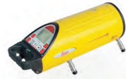
• Leica Piper 200 Pipe Laser $1,850