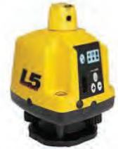
• Pro Shot L5 Rotating Laser $400