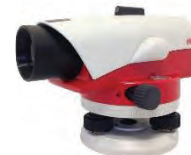
• Leica NA730 Autolevel $675