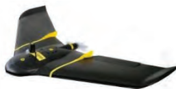
• senseFly eBee+ RTK Survey Drone $9,000