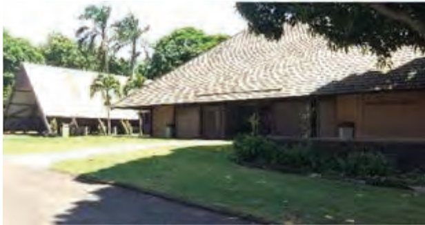
Atherton Hālau & Bowman Hālau Wa'a

Enjoy an afternoon and evening with fellow Hawaii surveyors, food and drinks donated by member organizations. $5 parking at Bishop Museum before 5PM or $3 parking after 5PM. Free street parking upon availability.