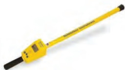
• Subsurface Instruments ML-1M Magnetic Locator $600