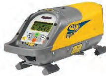
• Spectra DG511 Pipe Laser $2,100