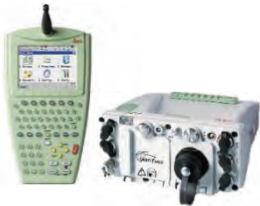
• Leica GRX1200 Pro Reference Receiver & RX1220T Data Collector $5,000