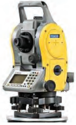
• Trimble TS662 Total Station $4,250