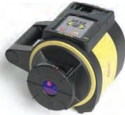
• Leica Rugby 840 Rotating Laser $1,500