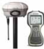
GNSS Surveying Systems