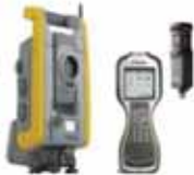
Robotic Total Stations