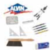
Drafting Tools & Supplies