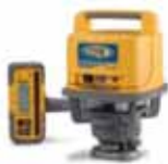
Level Lasers & Grade Lasers