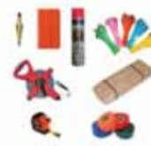
Field Tools & Supplies